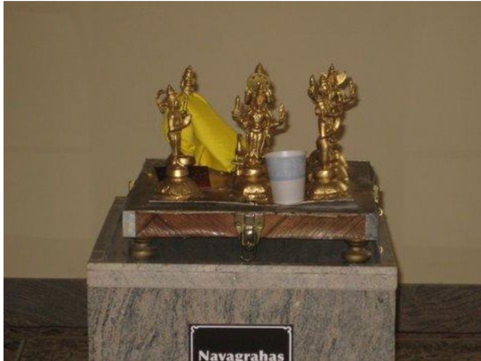
Navagrahas (Nine planets)