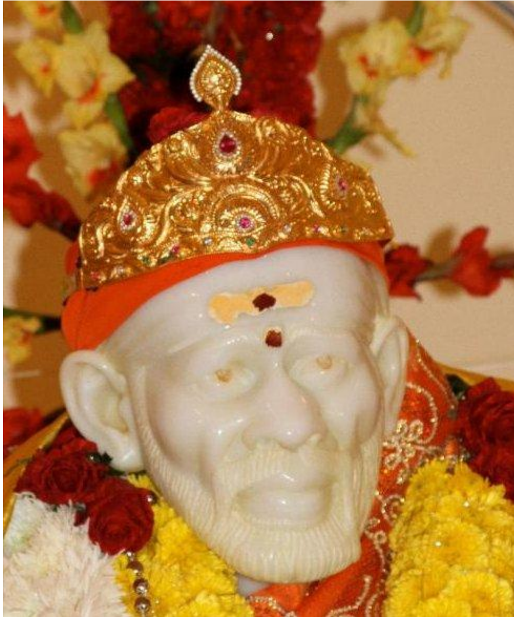
Sri Shirdi Sai Baba Moorti (statue)