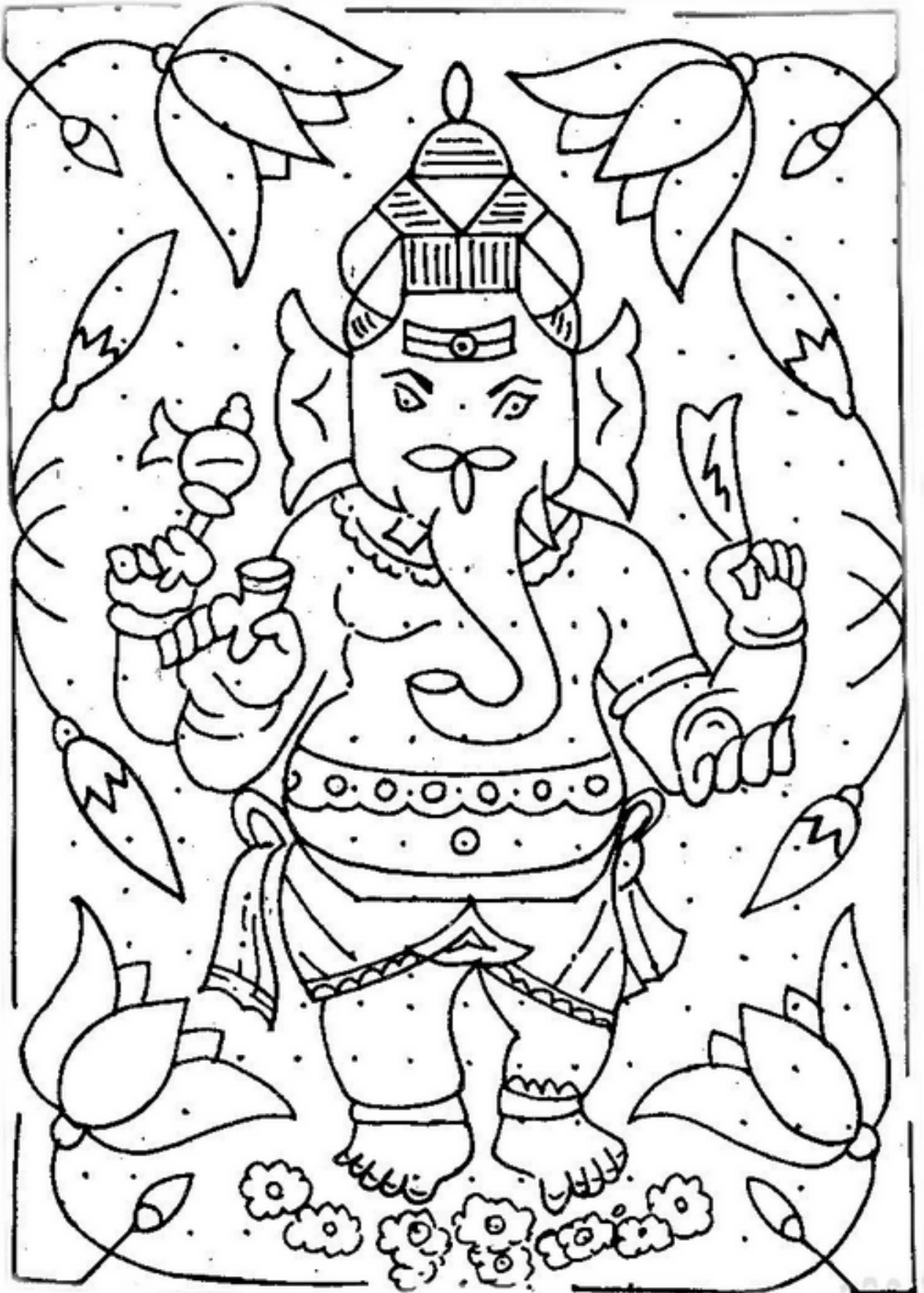
Coloring Exercise: Lord Ganesha